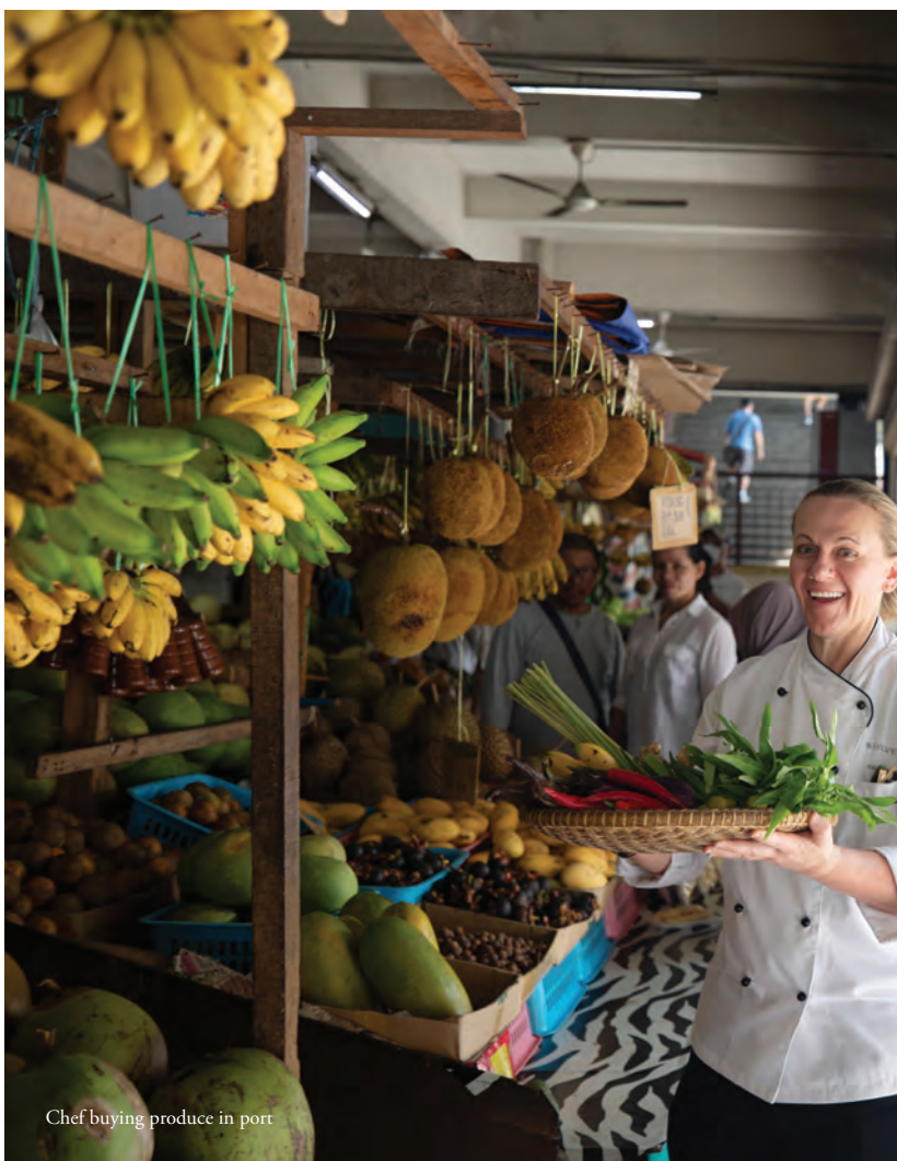
Chef buying produce in port

A true expression of Silversea's aim to take their guests closer to the authentic beauty of the world in luxury, S.A.L.T. will build on its commitment to unlocking unique and compelling experiences by connecting you with fascinating destinations and cultures.